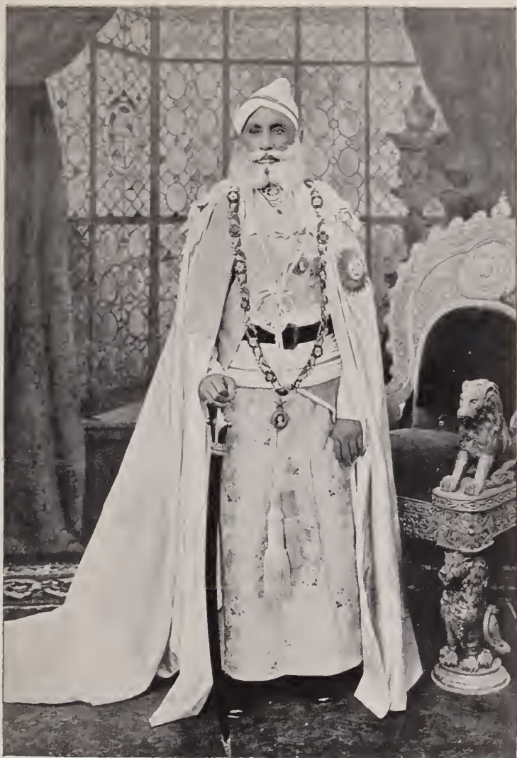
His Highness the Maharana of Udaipur, G.C.S.I., G.C.I.E.